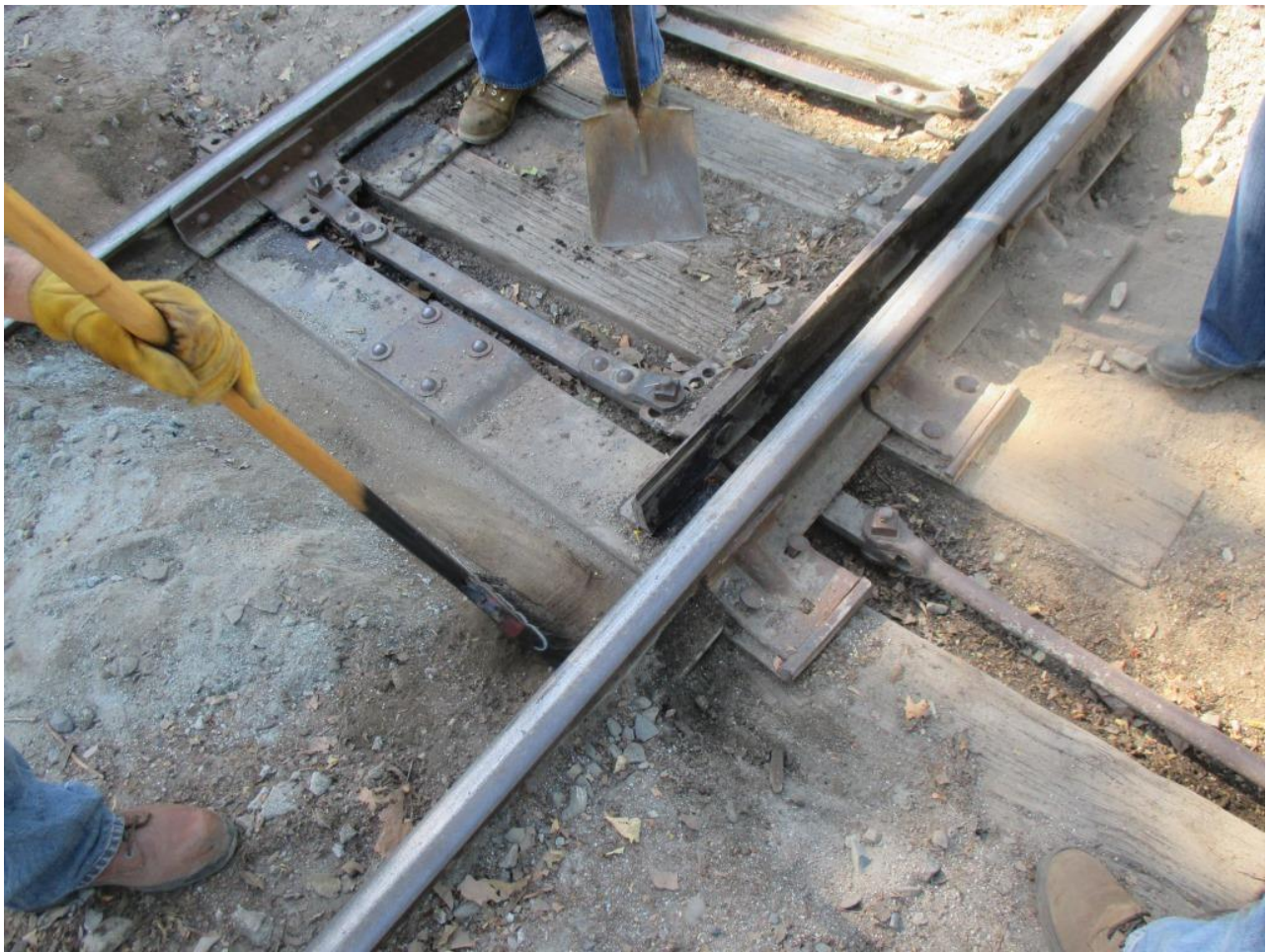
Yep, the gauge-plate is askew