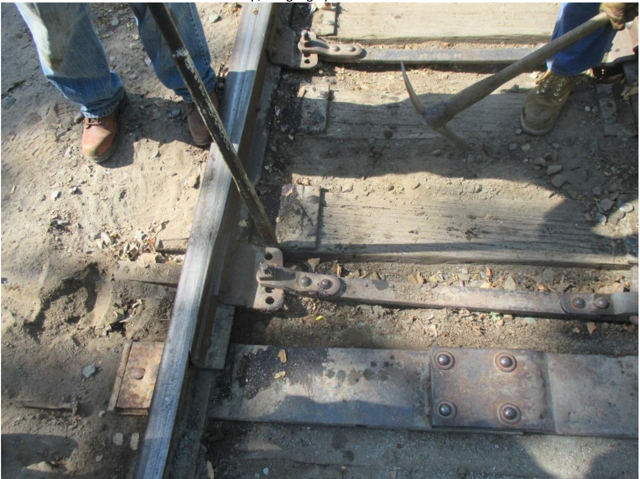
That's better. Team Grease Bucket makes it right!